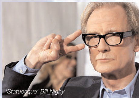
'Statuesque' Bill Nighy

'Stardust' creator, Neil Gaiman writes and directs 'Statuesque' a love story starring Bill Nighy about two statues stood motionless amongst the chaos of Christmas shoppers.