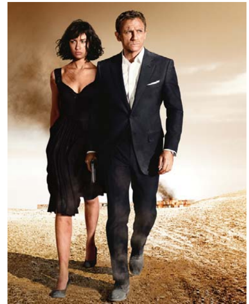
'Quantum of Solace' opens in the United Kingdom on 31st October. www.007.com

Committed to hunting down those responsible, Bond has to stay one step ahead of both his enemies and his own people as he battles to keep his desire for revenge over Vesper's death separate to the mission.